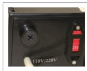
AC 110/220V Switch