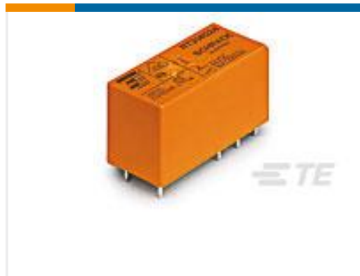
TE Model / Part #1-1393239-3 RT114024