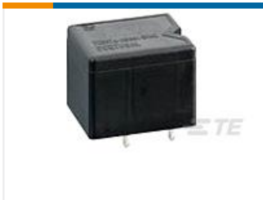
TE Model / Part #1393277-4 V23076A1001C133