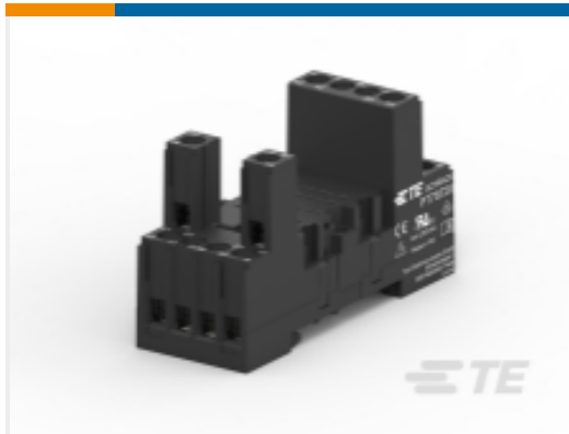
TE Model / Part #6-1415034-1 PT78720