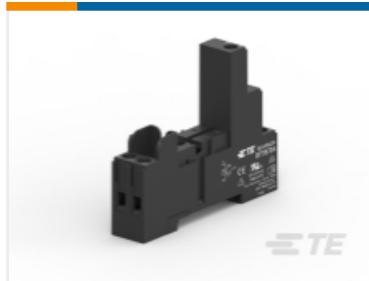
TE Model / Part #8-1415035-1 RT78724