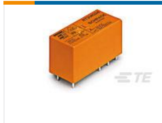
TE Model / Part #7-1393243-9 RT424730