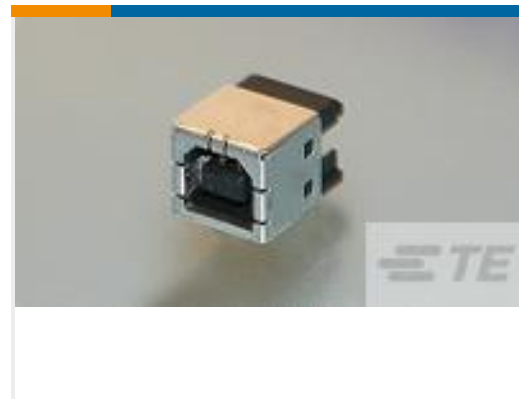
TE Model / Part #1734346-1 STD USB TYPE B, R/A, SMT