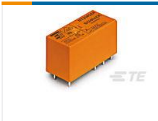
TE Model / Part #1419108-1 RT114012