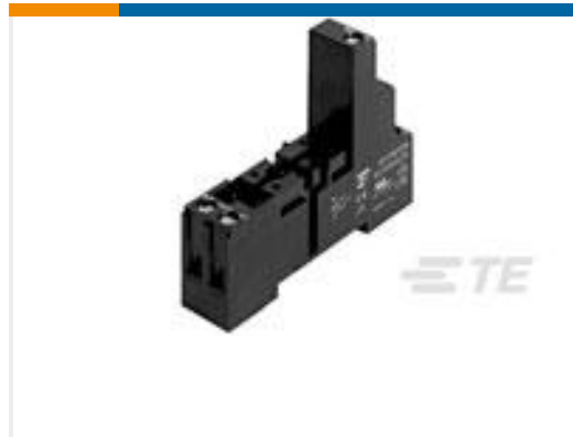
TE Model / Part #6-1415035-1 RT78726